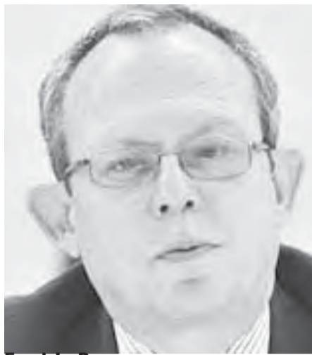
Frank La Rue

Bersih also expressed concern that the Malaysian government appears to be requesting governments not disposed to democratic reforms to